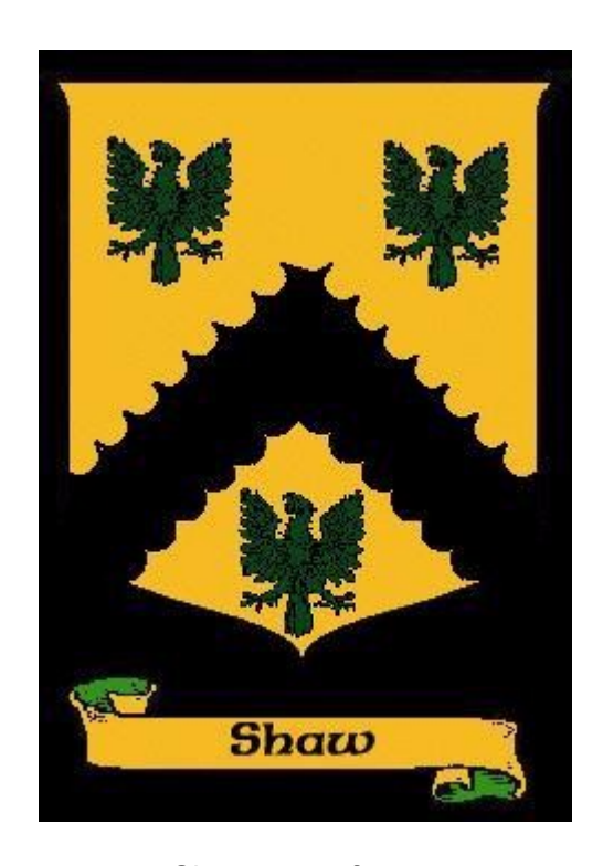
Shaw coat of arms

The name Shaw in Ireland is of Scottish origin having been brought to Ulster in the 16<sup>th</sup> century by settlers of the Mackintosh Clan. Descendants bearing this name can be found in all four provinces but the highest density is still in the province of Ulster. The Shaw family name bears the motto 'fide et fortitudine' which means 'by fidelity and fortitude'.